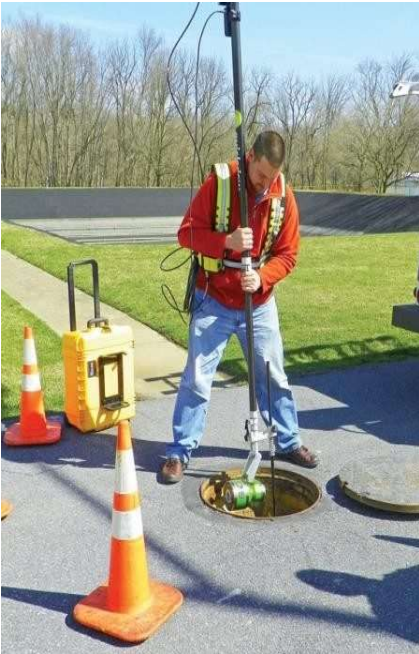
Typical Manhole Inspection, Digital Image. Municipal Sewer and Water Magazine. July 2011. https://www.mswmag.com/editorial/2011/07/get in get out

arrangements will be planned with residents accordingly. There should be minimal disturbance to private property during this work during the sewer inspection. There should be no disturbance to private property during manhole inspections. Sewer service will not be interrupted during the sewer, manhole, or lateral inspections.