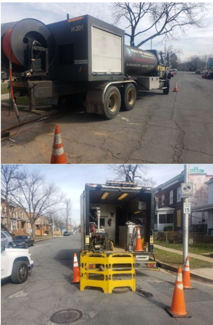
Example of typical CCTV inspection truck setup. In order to conduct CCTV inspections two trucks are needed, one at either end of the sewer.

Inspection of individual sewer segments typically takes 2-4 hours, depending on the length of sewer and number of lateral connections. The sewer segment inspections will consist of opening the manholes at either end of the sewer, inserting a crawling CCTV camera unit at one end and a jetting hose with a cleaning nozzle and root cutter at the other. The sewer will first be cleaned with the jetting hose and root cutter, then once the sewer has been confirmed to be appropriately cleaned the CCTV camera inspection will be performed which will identify the location of defects in the structure of the sewer and any sanitary laterals that enter the sewer from surrounding buildings. Once the sewer inspection is completed an inspection of the City-owned laterals (from the connection to the mainline sewer to just past the curb) will be performed. A different type of CCTV camera will be inserted in the sewer and will inspect each of the laterals individually.